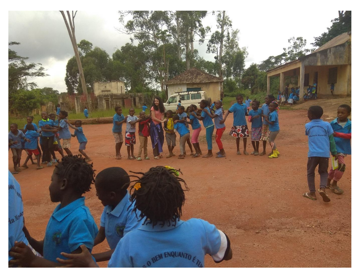
Dancing and playing games during the break