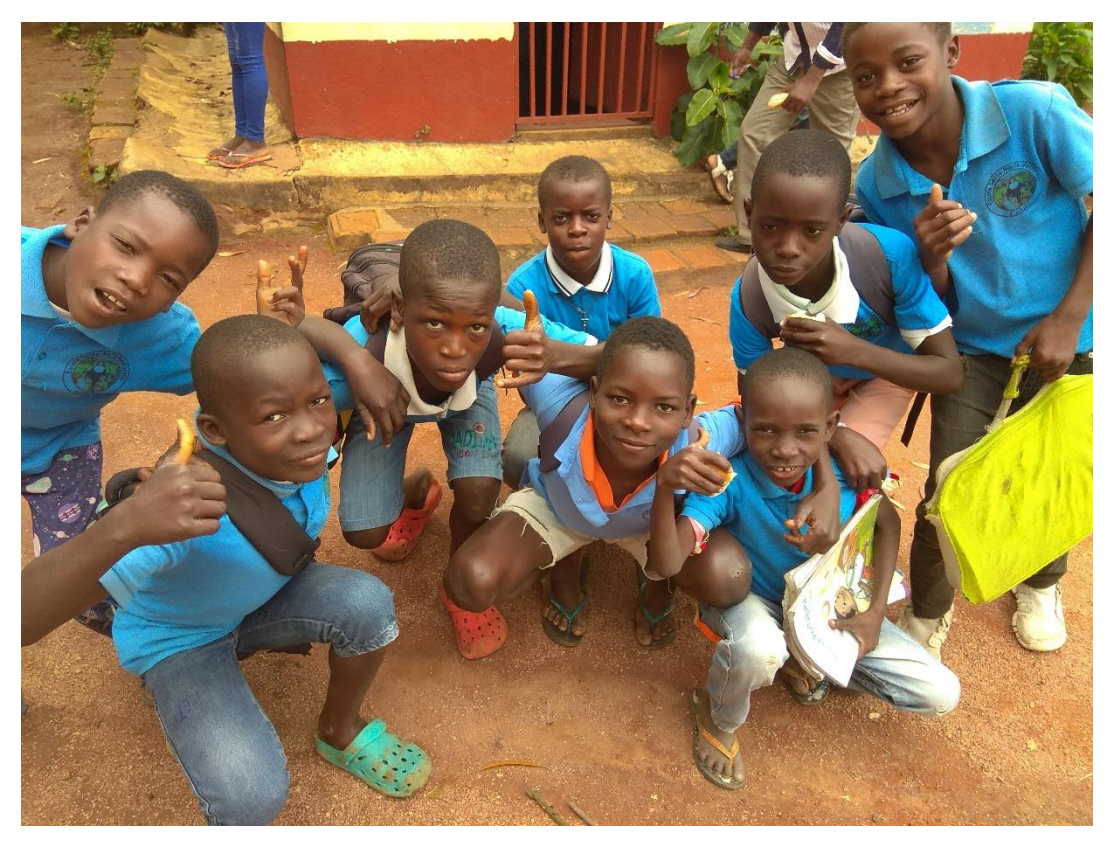
Students of the school