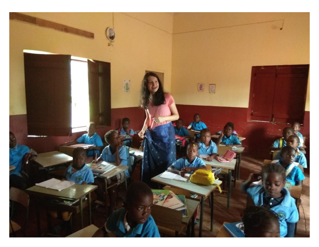
I am teaching at school