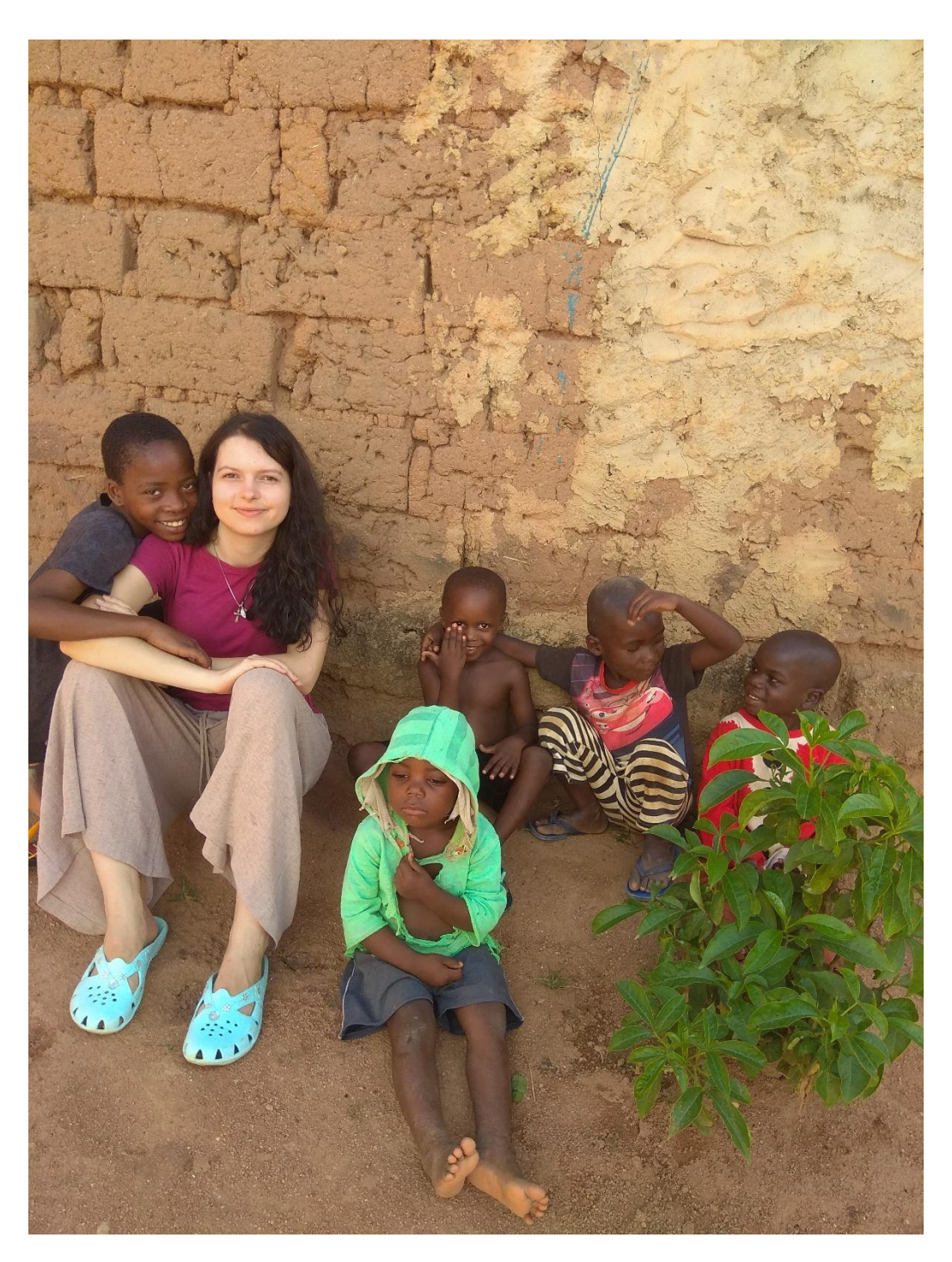
Me and children of a Calulo