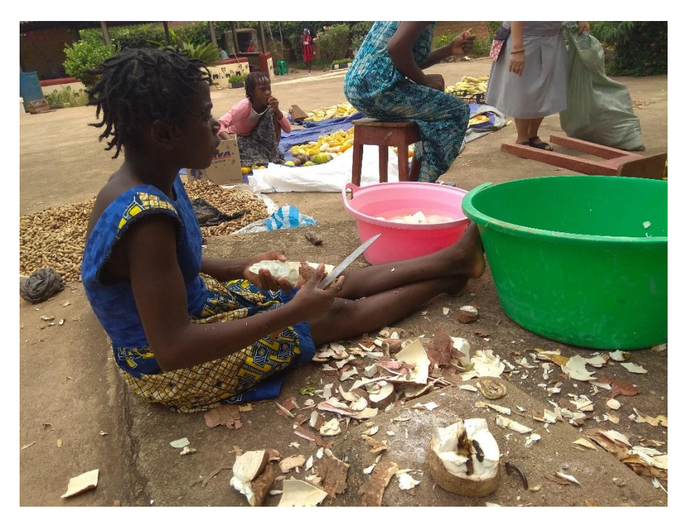
Girls of the boarding school are preparing food