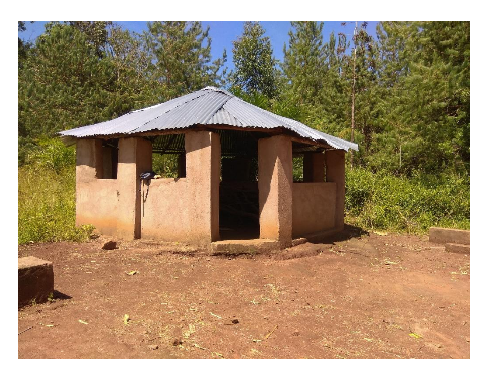
The school kitchen