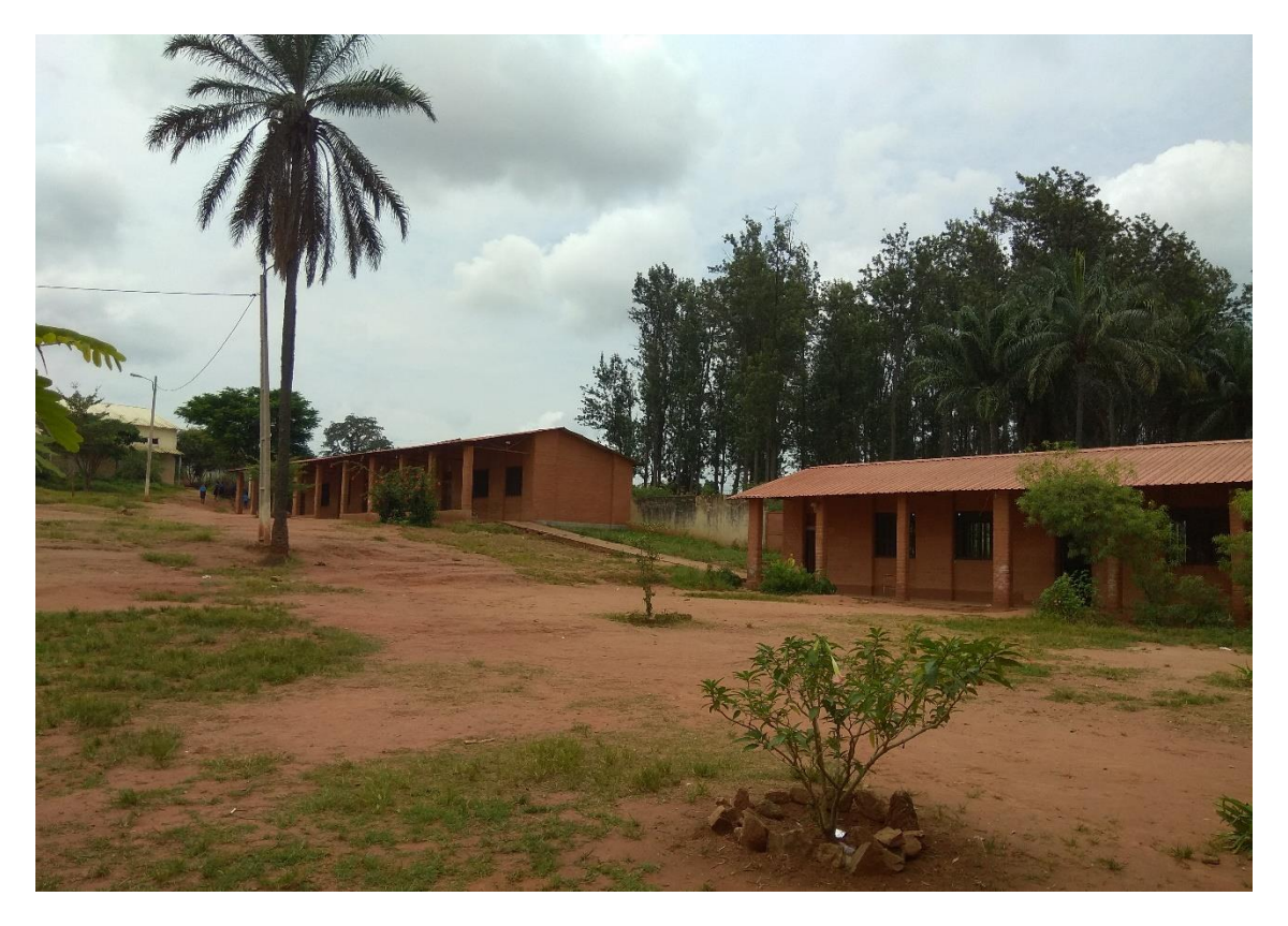
The school in Calulo