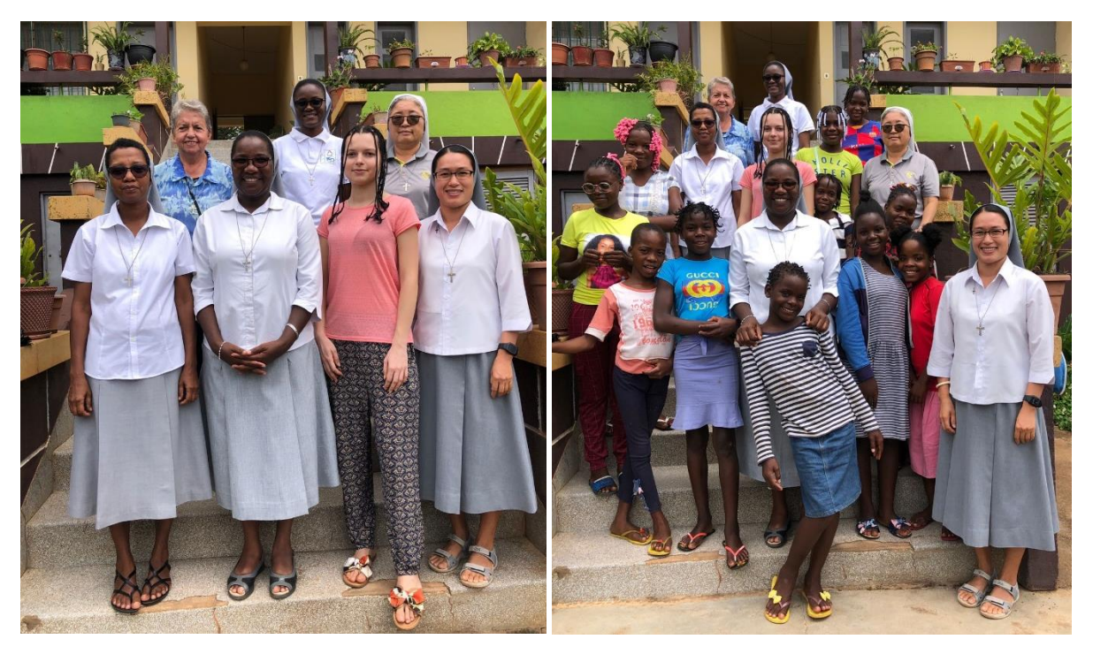
Me and nuns of Calulo