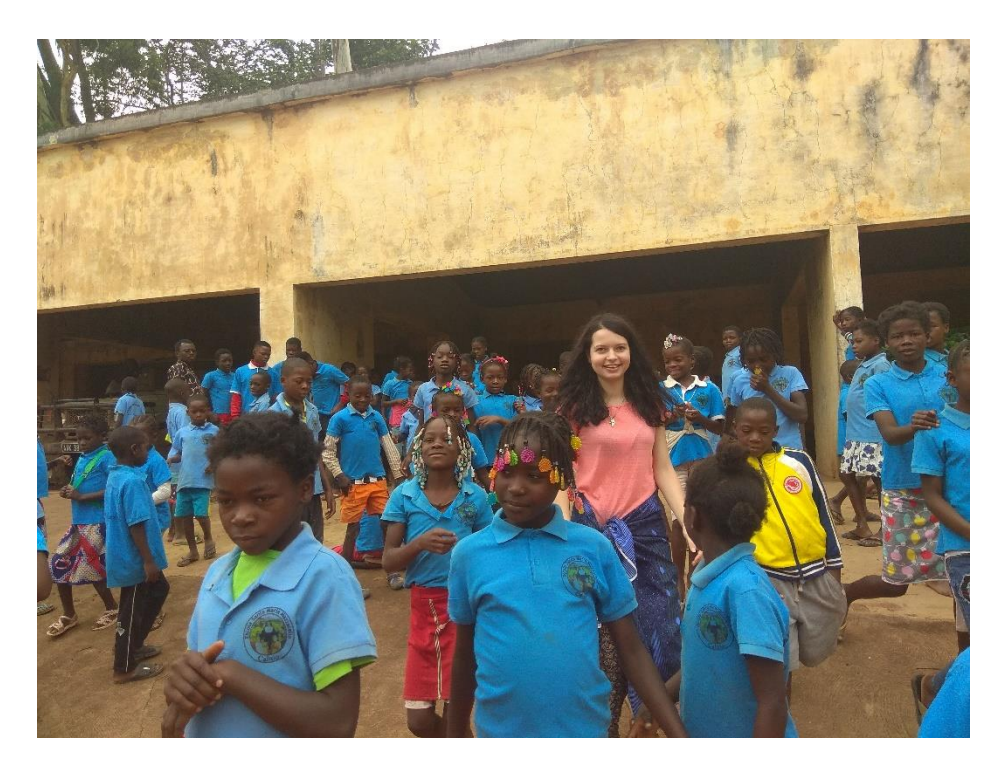
During the break at school