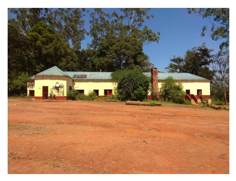
The school in Quitila