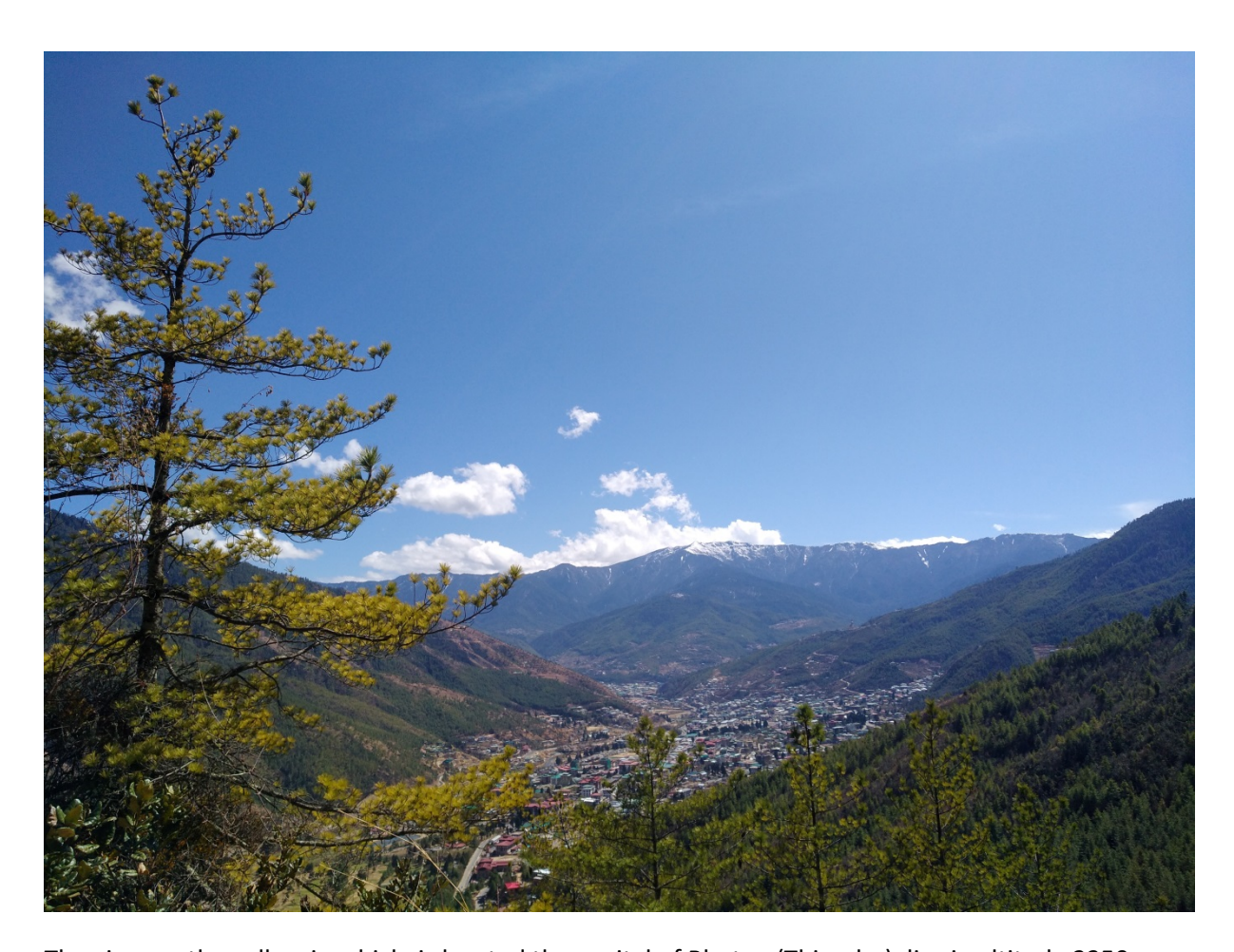
The view on the valley, in which is located the capital of Bhutan (Thimphu), lies in altitude 2350 metres.