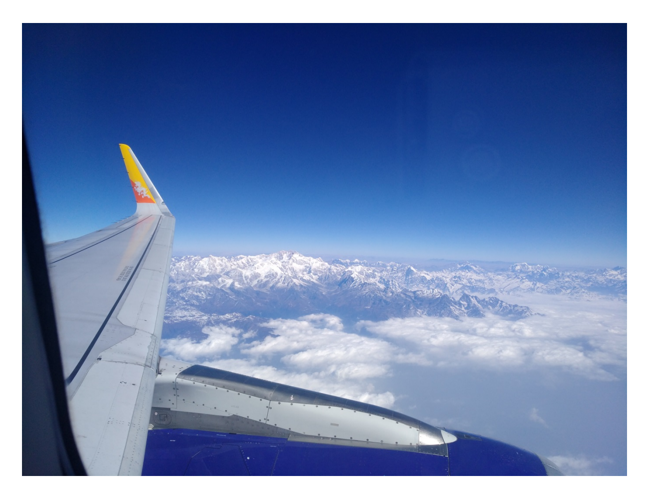
View on the Himalayas from the plane.