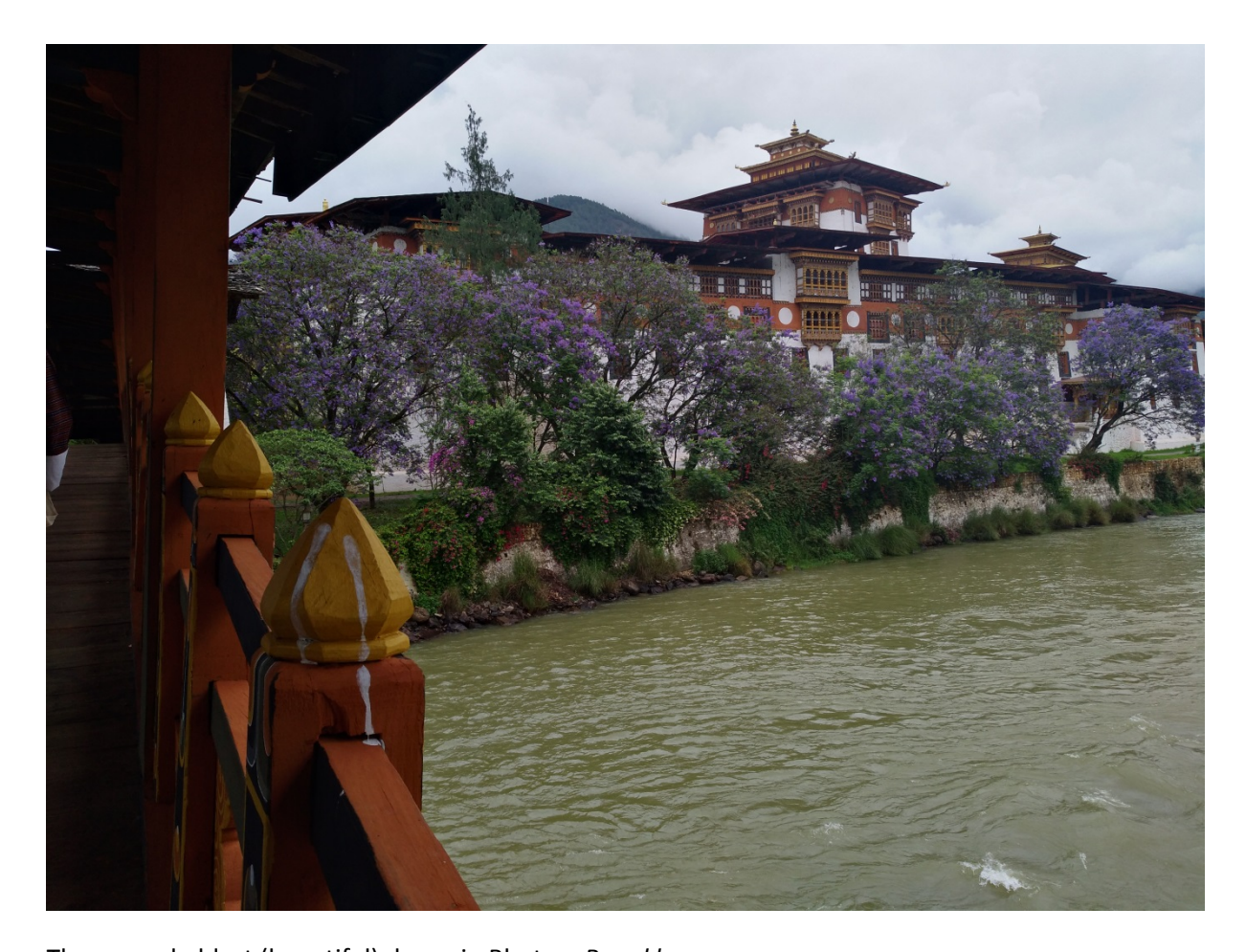
The second oldest (beautiful) dzong in Bhutan, Punakha.