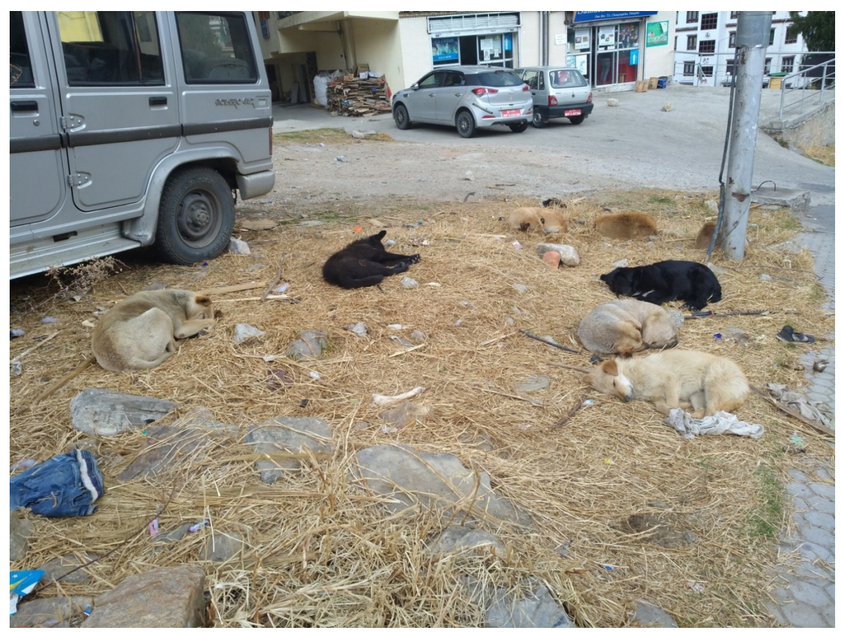
Another uniqueness of Bhutan is the number of street dogs, that you usually meet near shops and restaurants from which they receive leftovers.