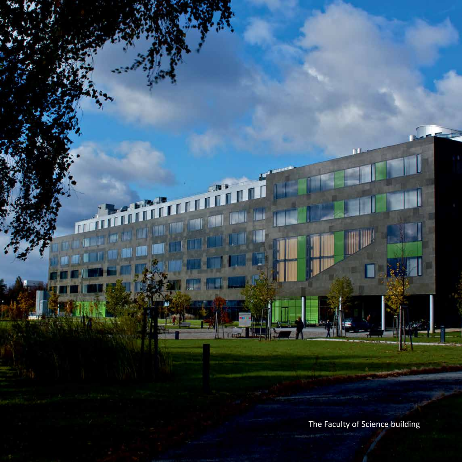
The Faculty of Science building