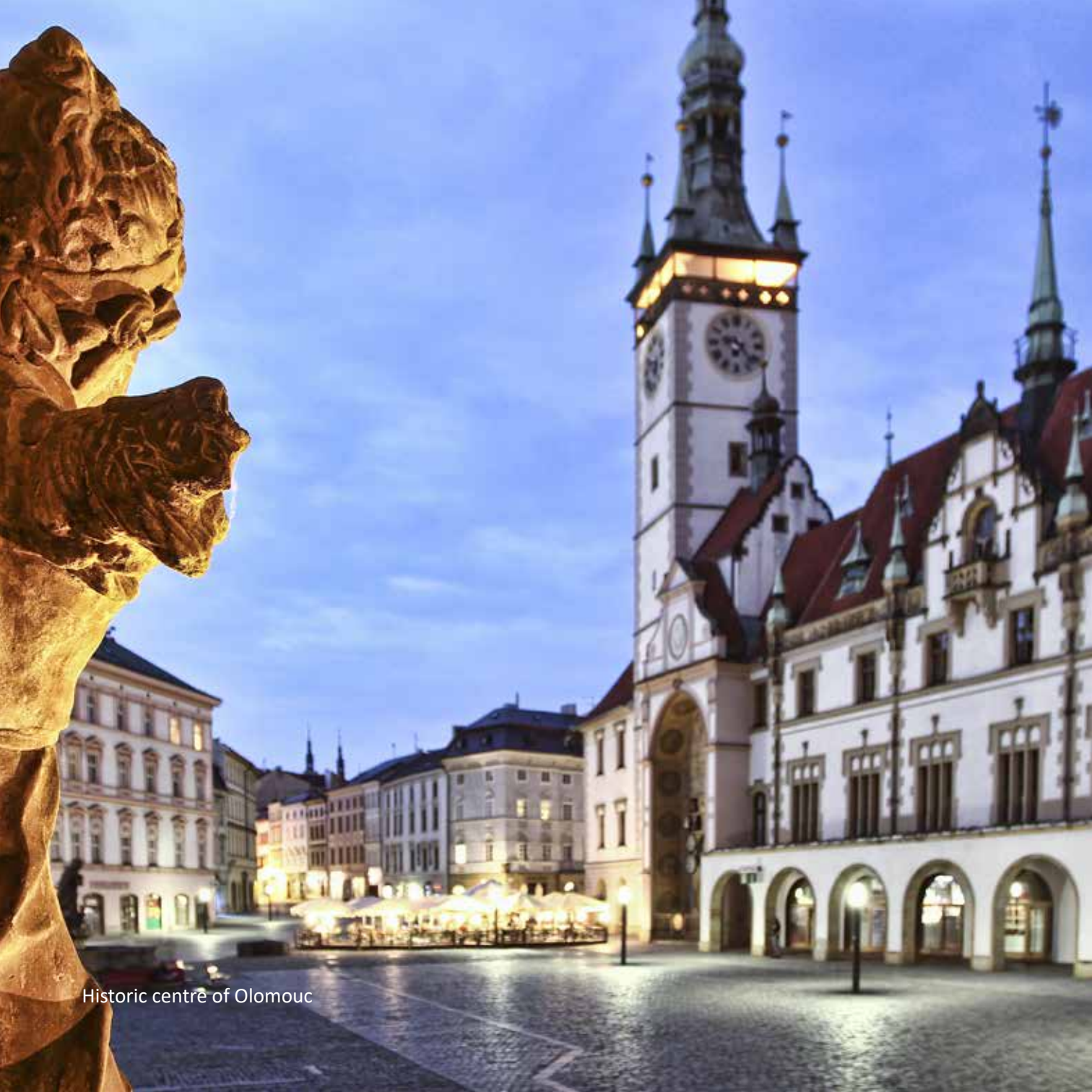
Historic centre of Olomouc