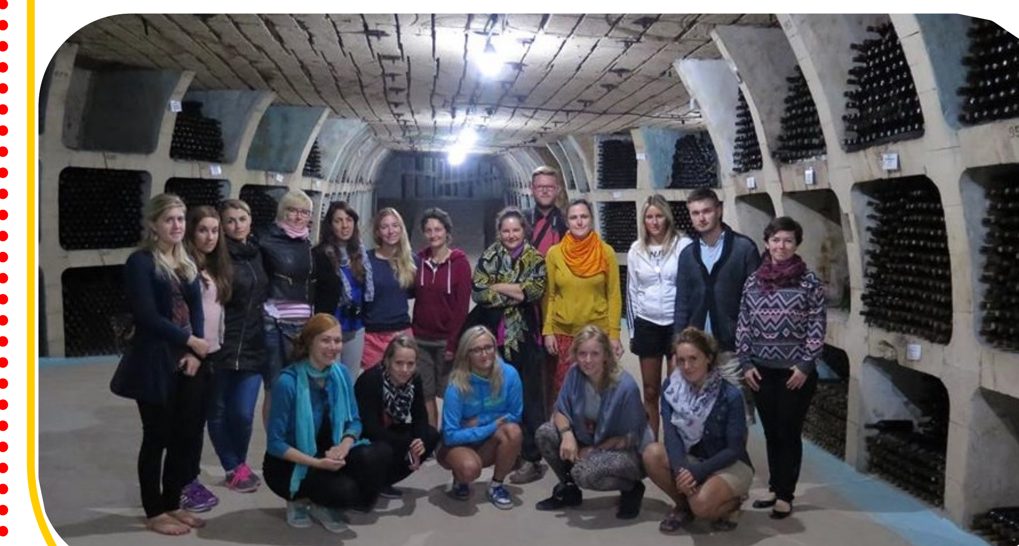
Group photo in the cellars of Milestii Mici .